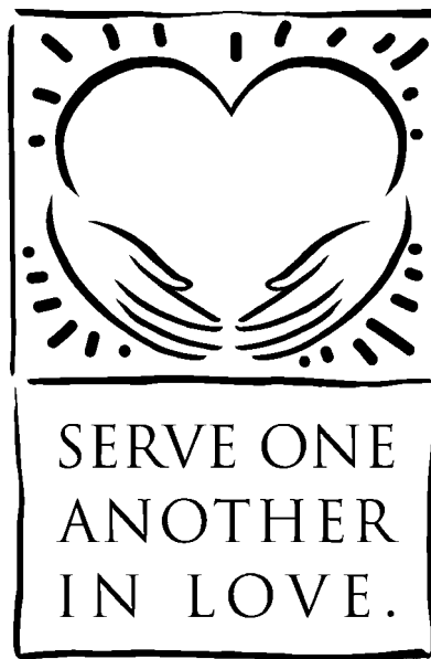
GALATIANS 5:13, NIV